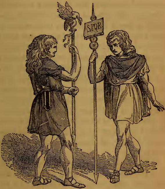
ROMAN STANDARD BEARERS.

the plain, and was terminated at the other extremity by strong squadrons of horse, and bodies of slingers and archers, so as to give the force of weapons and the activity of men as great a range as possible there, in order to prevent Cæsar's being able to outflank and surround them.